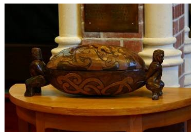
Taranga Te Kumete o Te Ao Maramatanga